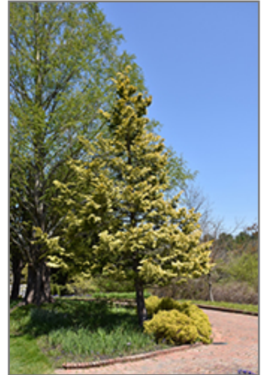
Cripps Gold Falsecypress

This tree does best in full sun to partial shade. It prefers to grow in average to moist conditions, and shouldn't be allowed to dry out. It is not particular as to soil type or pH. It is highly tolerant of urban pollution and will even thrive in inner city environments, and will benefit from being planted in a relatively sheltered location. Consider applying a thick mulch around the root zone in winter to protect it in exposed locations or colder microclimates. This is a selected variety of a species not originally from North America.