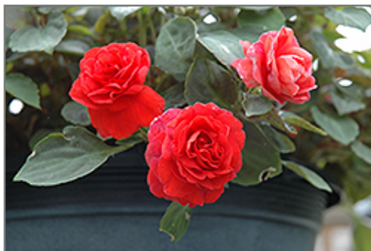
Fiesta Ole Deep Orange Double Impatiens flowers