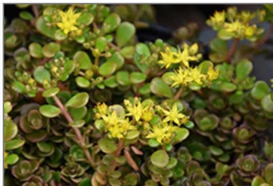
Chinese Sedum flowers