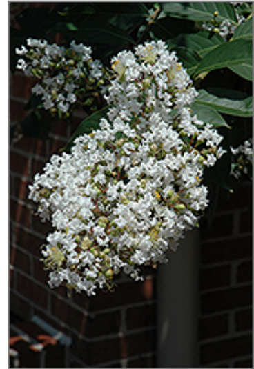
Natchez Crapemyrtle flowers

This is a relatively low maintenance tree, and is best pruned in late winter once the threat of extreme cold has passed. Deer don't particularly care for this plant and will usually leave it alone in favor of tastier treats. It has no significant negative characteristics.