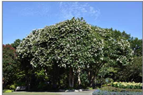
Natchez Crapemyrtle in bloom