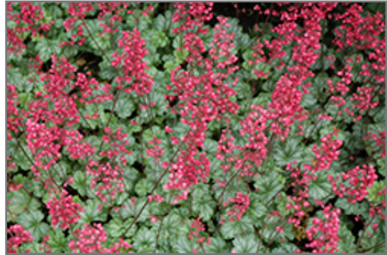
Paris Coral Bells in bloom

Paris Coral Bells will grow to be about 8 inches tall at maturity extending to 14 inches tall with the flowers, with a spread of 14 inches. When grown in masses or used as a bedding plant, individual plants should be spaced approximately 12 inches apart. Its foliage tends to remain low and dense right to the ground. It grows at a medium rate, and under ideal conditions can be expected to live for approximately 10 years. As an evergreen perennial, this plant will typically keep its form and foliage year-round.