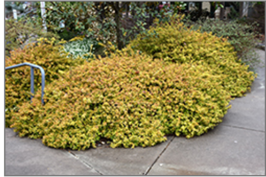
Kaleidoscope Abelia

Kaleidoscope Abelia will grow to be about 30 inches tall at maturity, with a spread of 4 feet. It tends to fill out right to the ground and therefore doesn't necessarily require facer plants in front. It grows at a slow rate, and under ideal conditions can be expected to live for approximately 30 years.