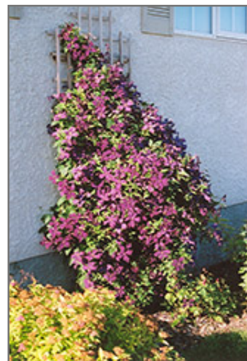
Polish Spirit Clematis in bloom