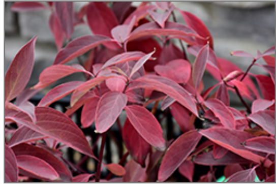
Arctic Fire Red Twig Dogwood in fall

This shrub does best in full sun to partial shade. It is an amazingly adaptable plant, tolerating both dry conditions and even some standing water. It is not particular as to soil type or pH. It is highly tolerant of urban pollution and will even thrive in inner city environments. This is a selection of a native North American species.