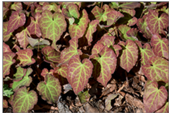
Froehnleiten Bishop's Hat foliage