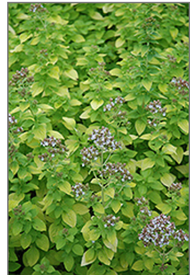
Golden Oregano flowers