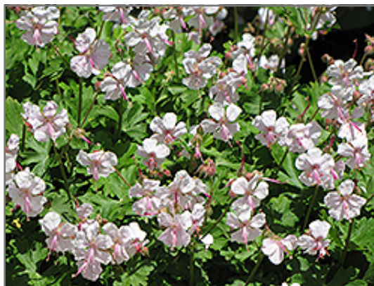
Biokovo Cranesbill in bloom

Biokovo Cranesbill is recommended for the following landscape applications;