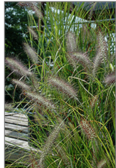
Cassian Dwarf Fountain Grass flowers