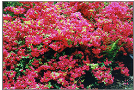
Hino Red Azalea in bloom