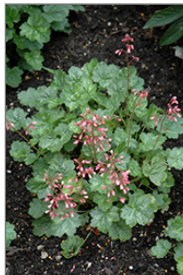
Little Cuties Peppermint Coral Bells in bloom