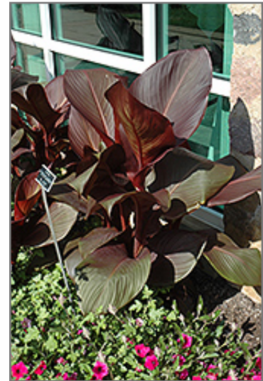
Tropicanna Black Canna

This plant is native to the tropics and prefers growing in moist environments with evenly warm conditions all year round. In our climate, it is usually grown as an outdoor annual in the garden or in a container. If you want it to survive the winter, it can be brought in to the house and provided with special care, and then returned to the garden the following season. In its preferred tropical habitat, it can grow to be around 5 feet tall at maturity, with a spread of 24 inches. However, when grown as an annual or when overwintered indoors, it can be expected to perform differently, and its exact height and spread will depend on many factors; you may wish to consult with our experts as to how it might perform in your specific application and growing conditions.