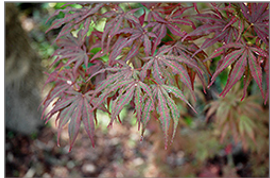
Mikazuki Japanese Maple foliage