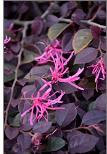
Crimson Fire Chinese Fringeflower flowers

Crimson Fire Chinese Fringeflower is recommended for the following landscape applications;