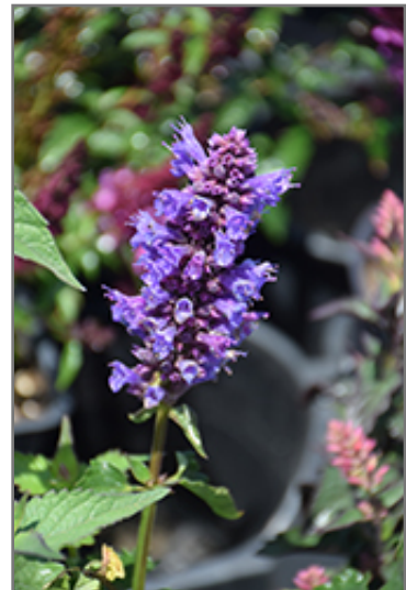
Blue Boa Hyssop flowers