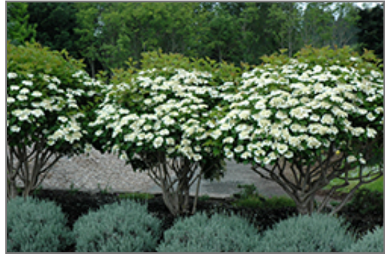
Compact European Cranberry in bloom

Compact European Cranberry is a dense multi-stemmed deciduous shrub with a more or less rounded form. Its average texture blends into the landscape, but can be balanced by one or two finer or coarser trees or shrubs for an effective composition.