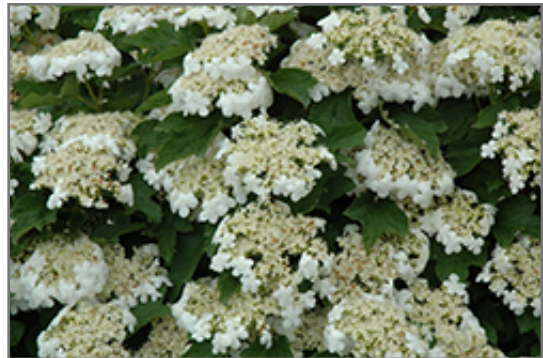
Compact European Cranberry flowers