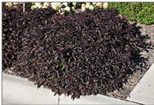
Spilled Wine Weigela