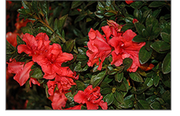
Encore Autumn Princess Azalea flowers