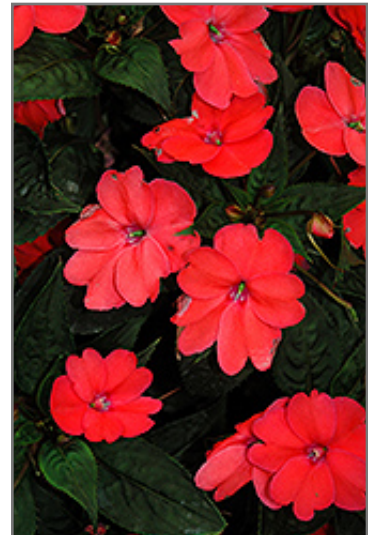
SunPatiens Compact Coral New Guinea Impatiens flowers

SunPatiens Compact Coral New Guinea Impatiens is recommended for the following landscape applications;