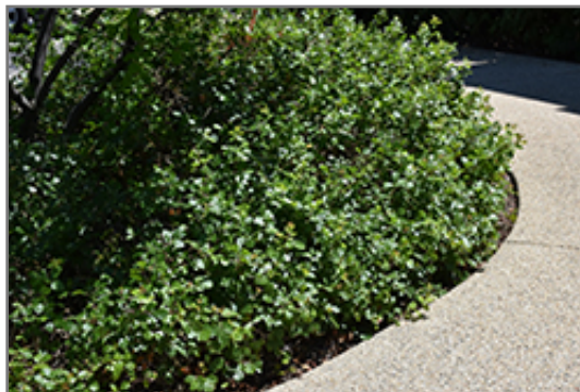
Gro-Low Fragrant Sumac

Gro-Low Fragrant Sumac is recommended for the following landscape applications;