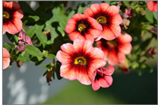
Superbells Coralberry Punch Calibrachoa flowers

Superbells Coralberry Punch Calibrachoa is a dense herbaceous annual with a trailing habit of growth, eventually spilling over the edges of hanging baskets and containers. Its medium texture blends into the garden, but can always be balanced by a couple of finer or coarser plants for an effective composition.