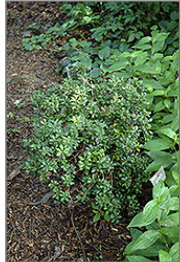
Bisbee Dwarf Japanese Pieris