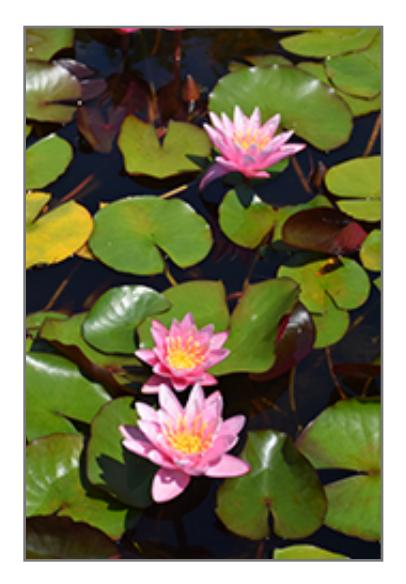
Pink Sensation Hardy Water Lily flowers