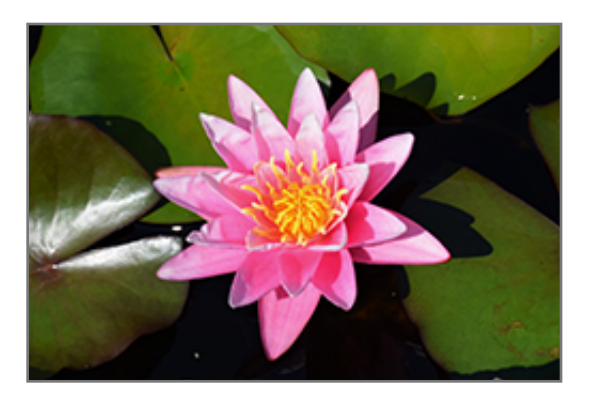
Pink Sensation Hardy Water Lily flowers