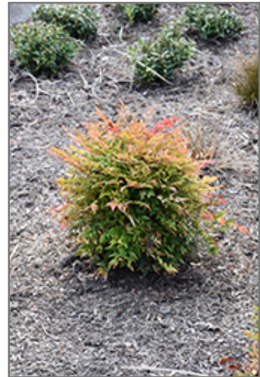
Gulf Stream Dwarf Nandina