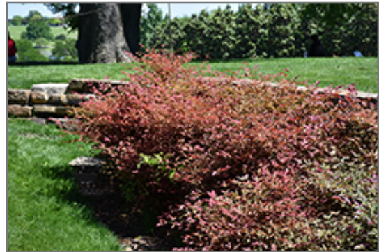
Flirt Nandina

Flirt Nandina is recommended for the following landscape applications;