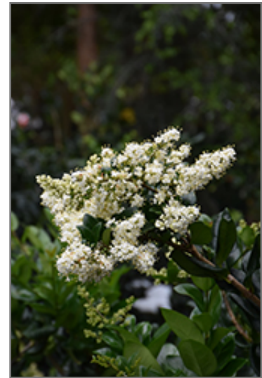
Japanese Privet flowers