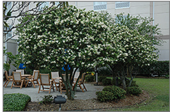
Japanese Privet in bloom

Japanese Privet is recommended for the following landscape applications;