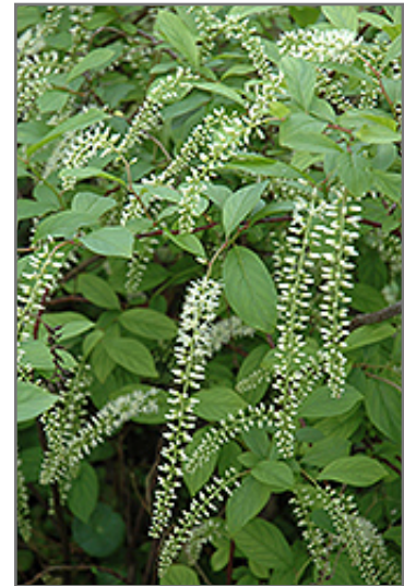
Henry's Garnet Virginia Sweetspire flowers

Henry's Garnet Virginia Sweetspire is recommended for the following landscape applications;