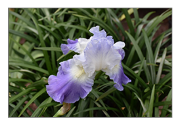
Clarence Iris flowers