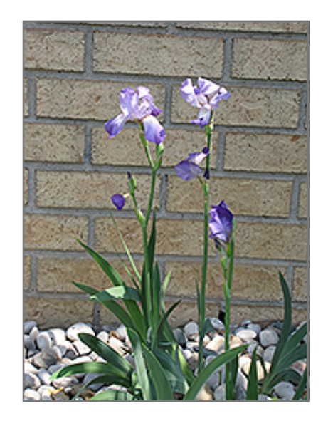
Clarence Iris flowers