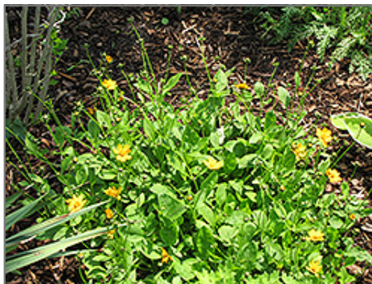
Sunshine Superman Tickseed in bloom