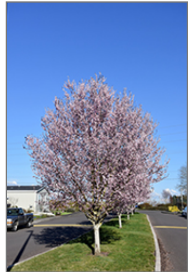
Krauter Vesuvius Plum in bloom