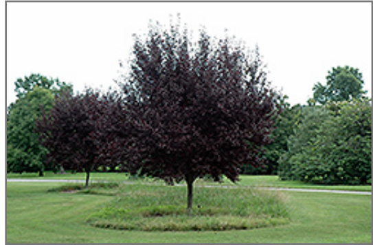
Krauter Vesuvius Plum

This tree should only be grown in full sunlight. It does best in average to evenly moist conditions, but will not tolerate standing water. It is not particular as to soil type or pH. It is highly tolerant of urban pollution and will even thrive in inner city environments. This is a selected variety of a species not originally from North America.