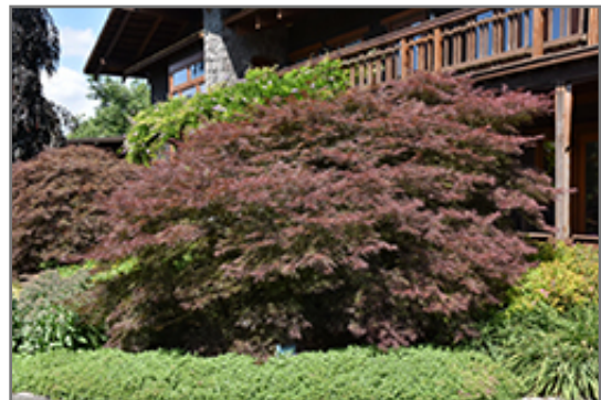
Ever Red Lace-Leaf Japanese Maple