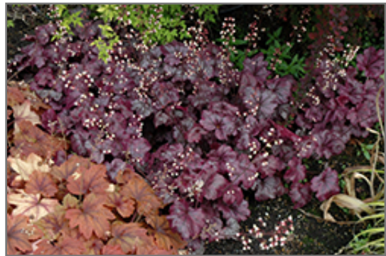
Plum Royale Coral Bells in bloom