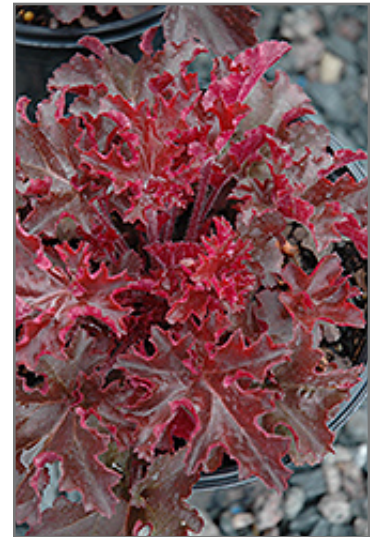
Melting Fire Coral Bells foliage

Melting Fire Coral Bells is recommended for the following landscape applications;