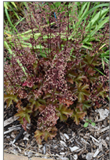
Melting Fire Coral Bells in bloom