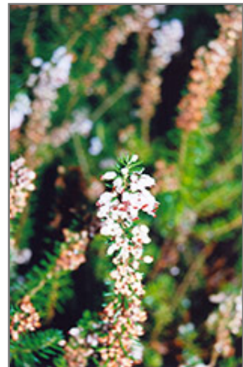
Scotch Heather flowers