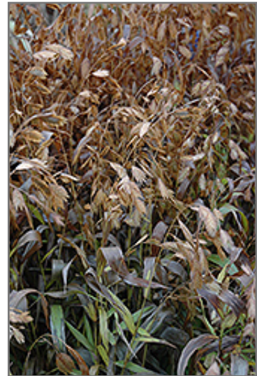
Northern Sea Oats in fall

Northern Sea Oats is recommended for the following landscape applications;