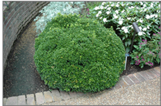
Compact Korean Boxwood

Compact Korean Boxwood is recommended for the following landscape applications;