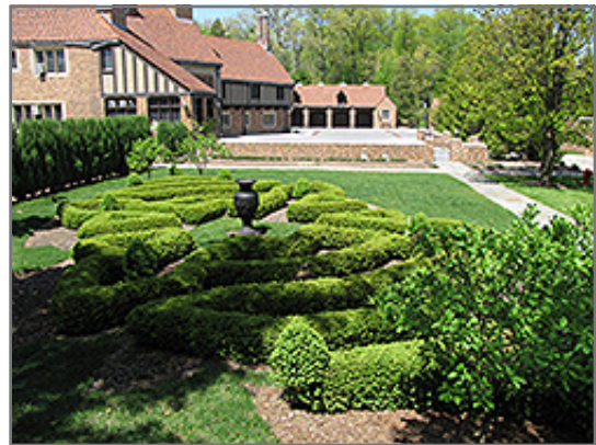
Compact Korean Boxwood

Compact Korean Boxwood will grow to be about 12 inches tall at maturity, with a spread of 12 inches. It tends to fill out right to the ground and therefore doesn't necessarily require facer plants in front. It grows at a slow rate, and under ideal conditions can be expected to live for approximately 30 years.