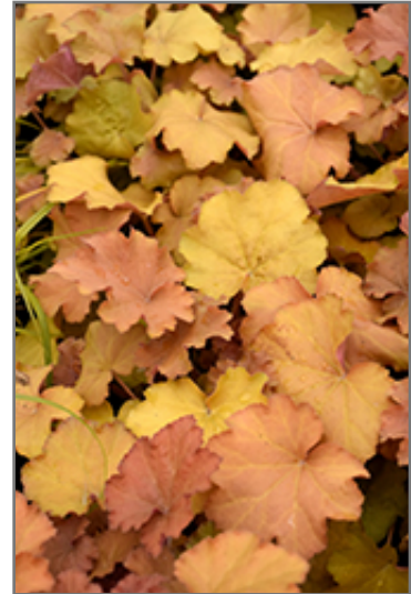
Caramel Coral Bells foliage

Caramel Coral Bells is recommended for the following landscape applications;