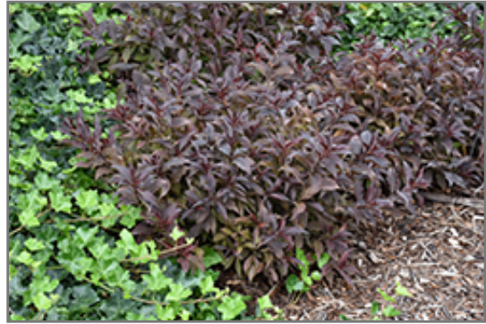
Midnight Wine Weigela

Midnight Wine Weigela makes a fine choice for the outdoor landscape, but it is also well-suited for use in outdoor pots and containers. It is often used as a 'filler' in the 'spiller-thriller-filler' container combination, providing a mass of flowers and foliage against which the thriller plants stand out. Note that when grown in a container, it may not perform exactly as indicated on the tag - this is to be expected. Also note that when growing plants in outdoor containers and baskets, they may require more frequent waterings than they would in the yard or garden.