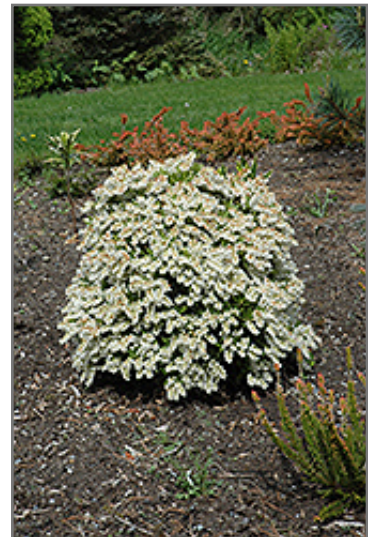
Prelude Japanese Pieris in bloom