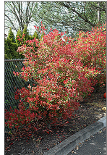
Fraser Photinia in bloom