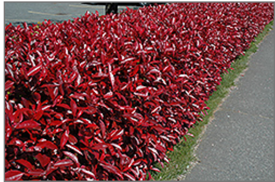
Fraser Photinia

Fraser Photinia will grow to be about 12 feet tall at maturity, with a spread of 7 feet. It tends to be a little leggy, with a typical clearance of 1 foot from the ground, and is suitable for planting under power lines. It grows at a fast rate, and under ideal conditions can be expected to live for 40 years or more.