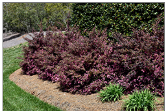
Red-Flowered Chinese Fringeflower in bloom