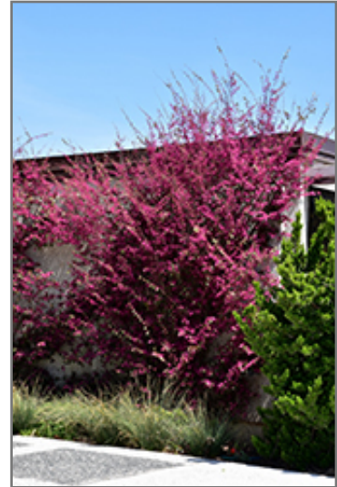
Red-Flowered Chinese Fringeflower in bloom

This shrub does best in full sun to partial shade. It prefers to grow in average to moist conditions, and shouldn't be allowed to dry out. It is particular about its soil conditions, with a strong preference for rich, acidic soils. It is somewhat tolerant of urban pollution. Consider applying a thick mulch around the root zone in winter to protect it in exposed locations or colder microclimates. This is a selected variety of a species not originally from North America.