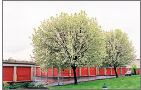
Bradford Ornamental Pear in bloom

Bradford Ornamental Pear is recommended for the following landscape applications;