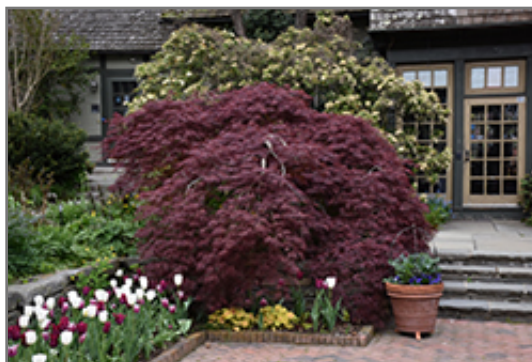
Tamukeyama Japanese Maple

Tamukeyama Japanese Maple is recommended for the following landscape applications;