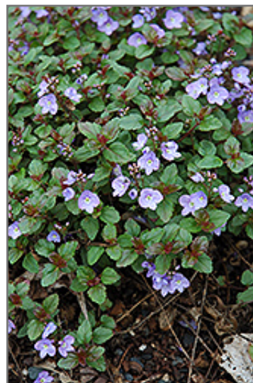
Waterperry Blue Speedwell in bloom