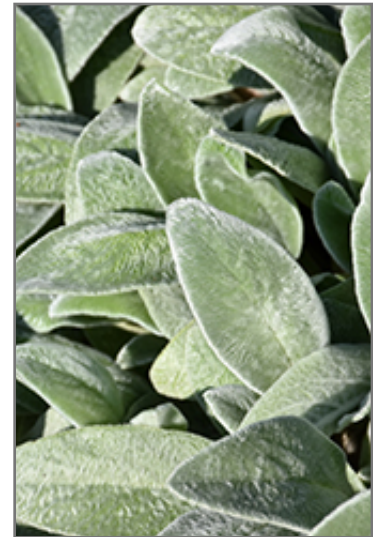
Lamb's Ears foliage

Lamb's Ears is recommended for the following landscape applications;