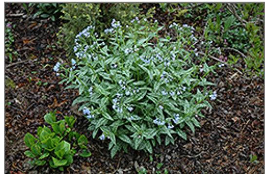
Roy Davidson Lungwort in bloom