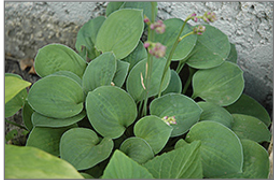
Baby Bunting Hosta foliage

Baby Bunting Hosta is recommended for the following landscape applications;